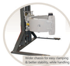
Wider chassis for easy clamping & better stability, while handling rolls.