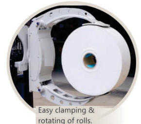
Easy clamping & rotating of rolls.