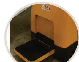
Stand on platform automatically closes through gas spring