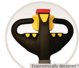
Ergonomically designed handle with all finger tips control.